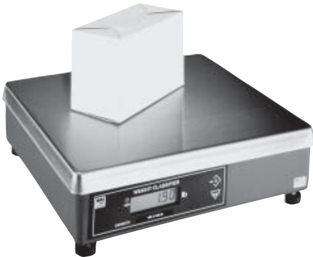
NCI Model 7820 shown with standard flat shroud.

The 7820 is simple to use, durable, accurate and reliable. This NTEP approved scale fits into any operation as a stand-alone scale, interfaced to a shipping manifest software, or receiving station.